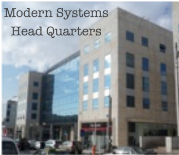
Modern Systems Head Quarters

MSCT bases our sales strategy on understanding your Business Needs and then applying its IT experience to help you chose the right technology for your organization. MSCT has worked with professionals in the Jordanian Market by helping them reach forward to the latest advancements in IT and help them do their work better and faster. Government